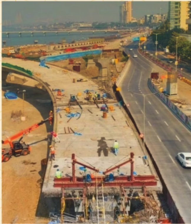
Versova-Dahisar Coastal Rd. (Upcoming) Future-proof connectivity to South Mumbai.