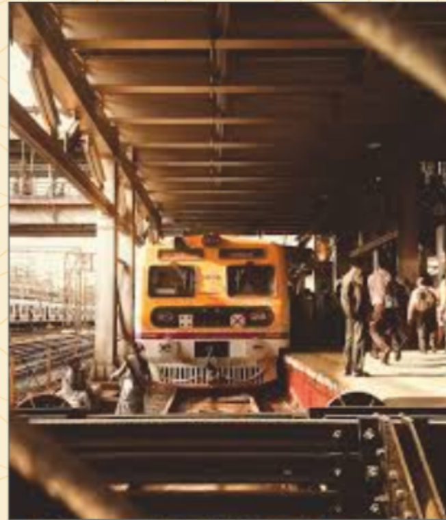
Dahisar Railway Station (6 Min Drive) Within a 6-minute drive for suburban rail convenience.