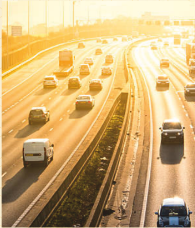
Western Express Highway (16 Min Drive) A 16-minute drive to prime city zones.